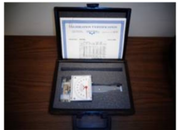
Instrument in case with calibration certificate